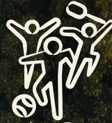
Tennis Court & Jogging Trails